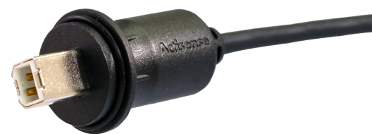
High quality USB lead.