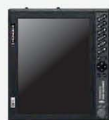
HE-775-Di Main Unit