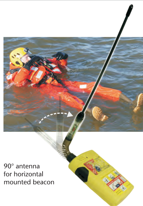
90° antenna for horizontal mounted beacon